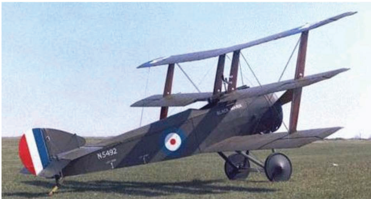
Aviation History, The Sopwith Triplane – Great Britain. (2006). The Aviation History On-Line Museum. Retrieved 20 March 2007, from http://www.aviation-history.com/sopwith/triplane.htm