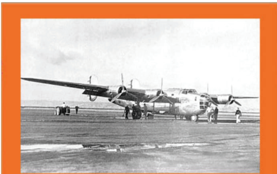
"Consolidated B-24 Liberator Bomber", Beehive Hockey Photos (2006). Retrieved 20 March 2007, from http://www.beehivehockey.com/photo_18liberator.htm