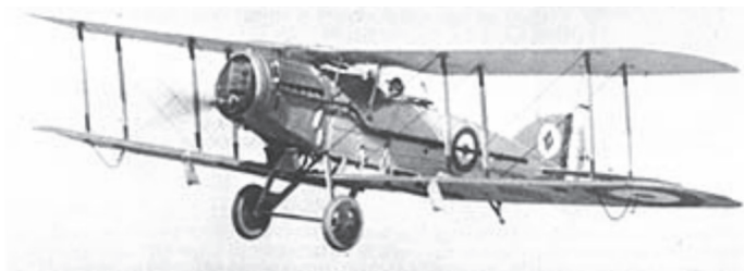
Aces and Aircraft of World War I, 2007, The Aerodrome. Bristol F.2B Fighter. Retrieved 20 March 2007, from http://www.theaerodrome.com/aircraft/gbritain/bristol_f2b.php